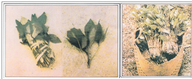
Figure 1: Bundles of khat, as typically traded

Moreover, the borders of the Kingdom are very close to Yemen, where the production of narcotics leads to ease of distribution and increased smuggling. However, based on examinations, the negative culture associated with narcotic drugs is increasing among the teenage proportion of the Saudi population. Therefore, seizures of smuggled drugs are causing alarm among both scientists and local authorities [7-12].